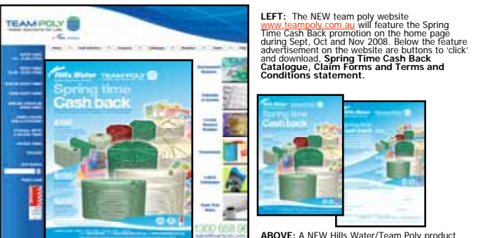
LEFT: The NEW team poly website www.teampoly.com.au will feature the Spring Time Cash Back promotion on the home page during Sept, Oct and Nov 2008. Below the feature advertisement on the website are buttons to click and download, Spring Time Cash Back Catalogue, Claim Forms and Terms and Conditions statement.