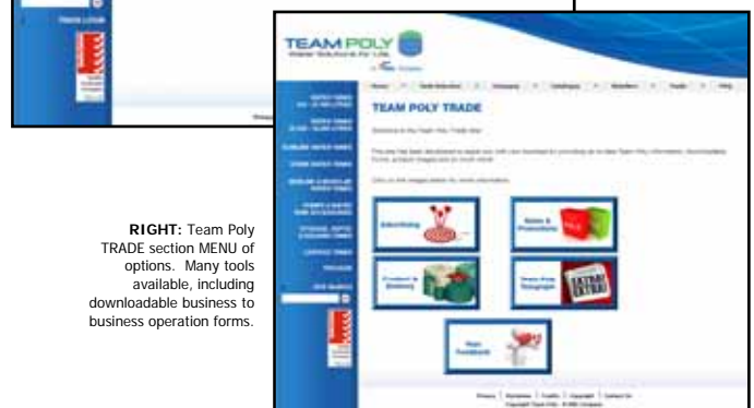
RIGHT: Team Poly TRADE section MENU of options. Many tools available, including downloadable business to business operation forms.

L ead times for product orders are at exceptional levels in Spring 2008. With Team Poly production facilities in QLD Toowoomba, NSW Bathurst, VIC Ballarat and SA Lonsdale, your product order will be manufactured and delivered in a very short period of time.