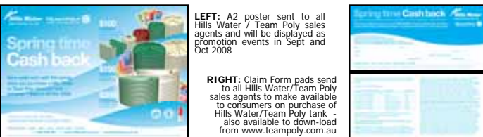
LEFT: A2 poster sent to all Hills Water / Team Poly sales agents and will be displayed as promotion events in Sept and Oct 2008