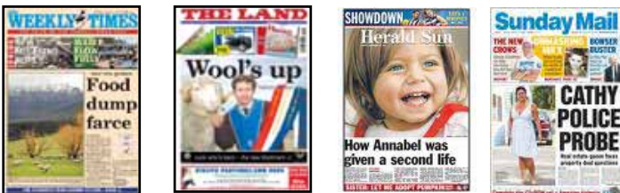
ABOVE: MEDIA publications (newspapers) cover pages where the Spring Time Cash Back promotion will be promoted with advertising executions.

M edia publications where the promotion will be advertised include RURAL PRESS: QLD Country Life, NSW The Land, VIC Stock & Land, SA Stock Journal and WA Farm Weekly and the National Weekly Times. URBAN MEDIA will include BRISBANE Sunday Mail, SYDNEY Sunday Telegraph, MELBOURNE Sunday Herald Sun and ADELAIDE Sunday Mail – TV Guides in all metro papers.