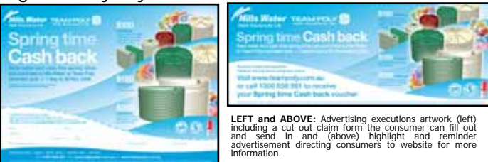
LEFT and ABOVE: Advertising executions artwork (left) including a cut out claim form the consumer can fill out and send in and (above) highlight and reminder advertisement directing consumers to website for more information.

P romotional support material to ensure this event has high visibility in your store is as follows;